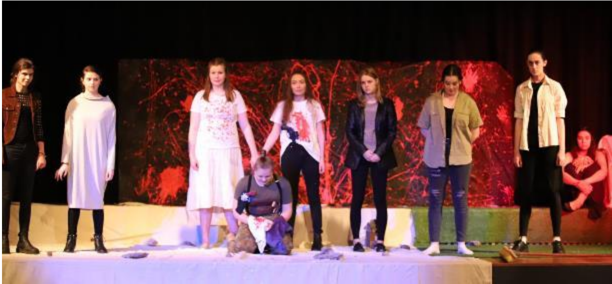
Drama performance 'Antigone' 2018

Drama students in Year 9 are offered the opportunity to discover and develop their performance and technical skills through a variety of classic and modern dramatic styles. Through the experience of theatre and popular play styles, students are encouraged to examine their own development by adapting the unique styles of acting and performance techniques as well as the chance to engage more specifically with theatrical design and production elements. Students are also encouraged to create their own plays focussing on themes relevant to their own ideas and interests.