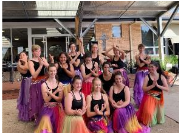
Merici College Dance Troupe performing at community events throughout 2019