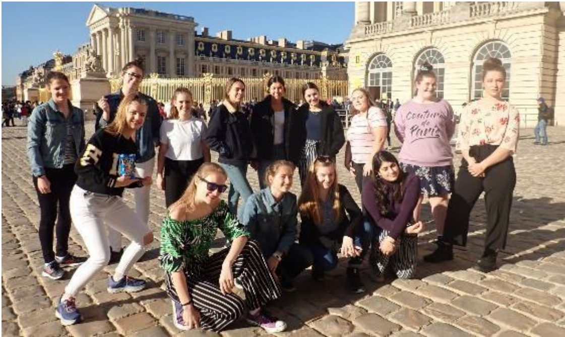
French Study Tour 2018

Study tours are organised on a rotating basis across the Languages.