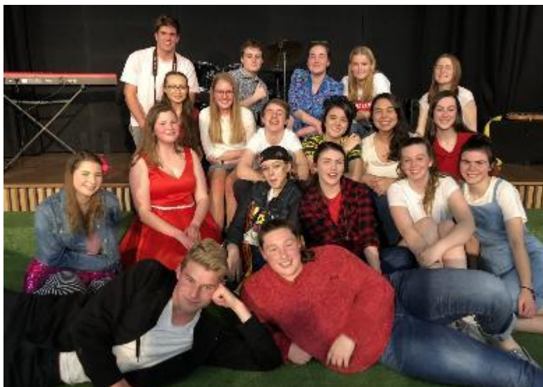
Drama production 'Behind the Drum' 2018

Students studying Drama in Year 10 are provided with a variety of creative and technical opportunities to deepen the exploration of their own styles and interests in dramatic performance. In Semester 1, particular emphasis on dramatic performance and musical theatre is offered. Students engage in a variety of performance skills and devices which draw on the theatrical significance in terms of dramatic interpretation and performance. In Semester 2, students focus on contemporary theatre and its importance as a development of traditional theatre forms. Students draw on their collaborative skills and individual input in the play-building process through technical and administrative areas such as direction; dramaturgy; stage management; scriptwriting and all aspects of theatrical design, culminating in a public performance towards the end of Term 4.