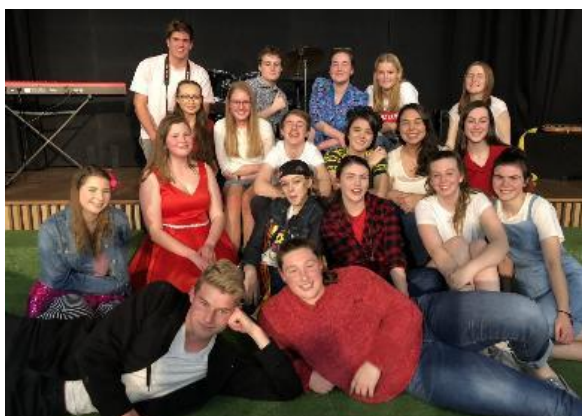
Drama production 'Behind the Drum' 2018

Students studying Drama in Year 10 are provided with a variety of creative and technical opportunities to deepen the exploration of their own styles and interests in dramatic performance. In Semester 1, particular emphasis on dramatic performance and musical theatre is offered. Students engage in a variety of performance skills and devices which draw on the theatrical significance in terms of dramatic interpretation and performance. In Semester 2, students focus on contemporary theatre and its importance as a development of traditional theatre forms. Students draw on their collaborative skills and individual input in the play-building process through technical and administrative areas such as direction; dramaturgy; stage management; scriptwriting and all aspects of theatrical design, culminating in a public performance towards the end of Term 4.