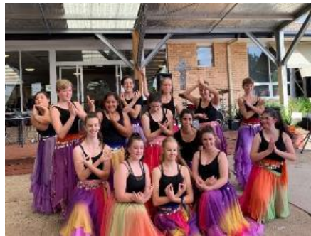
Merici College Dance Troupe performing at community events throughout 2019