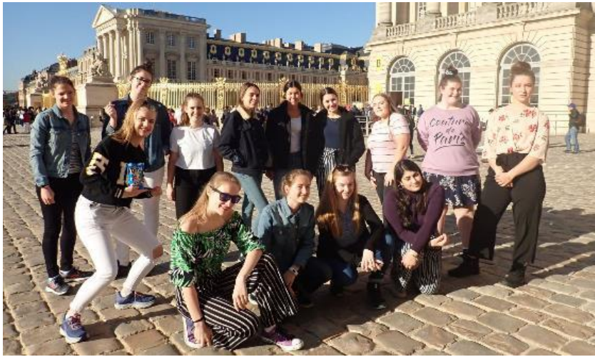
French Study Tour 2018

Study tours are organised on a rotating basis across the Languages.