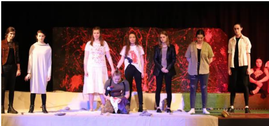
Drama performance 'Antigone' 2018

Drama students in Year 9 are offered the opportunity to discover and develop their performance and technical skills through a variety of classic and modern dramatic styles. Through the experience of theatre and popular play styles, students are encouraged to examine their own development by adapting the unique styles of acting and performance techniques as well as the chance to engage more specifically with theatrical design and production elements. Students are also encouraged to create their own plays focussing on themes relevant to their own ideas and interests.